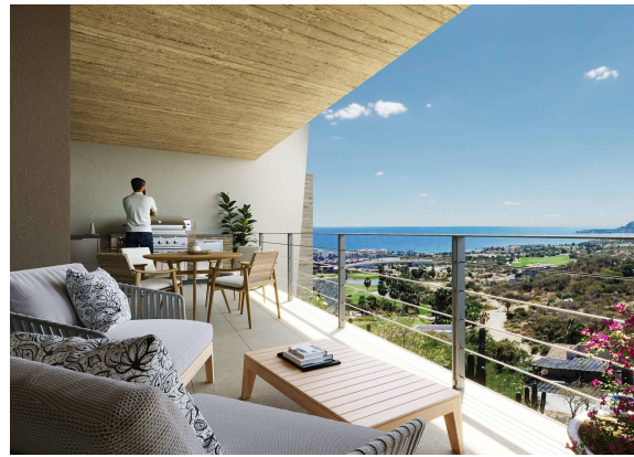
3 BEDROOMS | 3.5 BATHROOMS MLS: 22-3966

This spectacular three-bedroom penthouse offers over 3,060 square feet of effortless luxury. Arrive to unobstructed ocean views overlooking the exclusive 18-hole Nicklaus-designed golf course and Palmilla Point. Beautifully appointed with floor-to-ceiling windows, custom white oak carpentry, and Italian porcelain floors. Entertain from the expansive open-concept living and dining areas that flow seamlessly onto a large terrace or from the 702.8 square-foot private rooftop terrace. A fully equipped Italian kitchen is complete with luxury appliances and a built-in breakfast bar. The flexible studio can be adapted to a privileged home office, media room, or service room. The spacious primary bedroom features a beautifully designed walk-in closet, an ensuite bathroom with dual vanities, and direct access to the terrace.