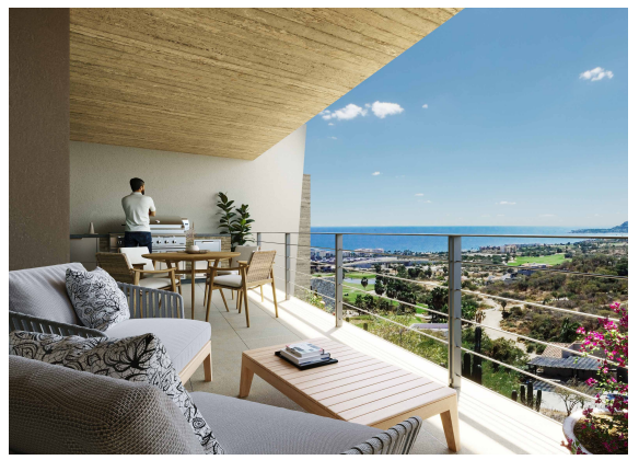
3 BEDROOMS | 3 BATHROOMS MLS: 22-3962

Unobstructed ocean views overlook the Nicklausdesigned 18-hole golf course and Palmilla Point from floor-to-ceiling double-glazed windows that open onto a large terrace. Beautifully appointed with white oak custom carpentry and Italian porcelain floors, this residence exudes effortless sophistication. The open-concept living and dining areas open onto a 436-square-foot terrace for optimal entertaining. A fully equipped Italian kitchen is complete with luxury appliances and soft-close hinges. The flexible studio can be a bedroom, home office, media room, or service room. In front, you will find an additional ensuite bedroom tucked away at the back of the residence for extra privacy. The primary bedroom features an ensuite bathroom with double vanities, a large walk-in closet, and direct access to the terrace with magnificent views.