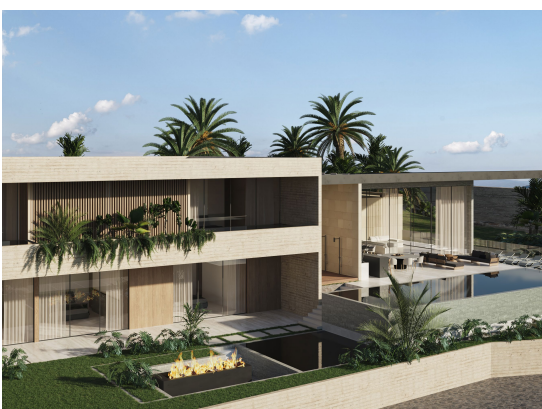
THE RENDERS ARE A CONSTRUCTION PROPOSAL; THIS CONSTRUCTION IS NOT INCLUDED IN THE SALE PRICE